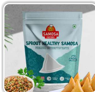
Sprout Healthy Samosa