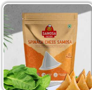
Spinach Cheese Samosa