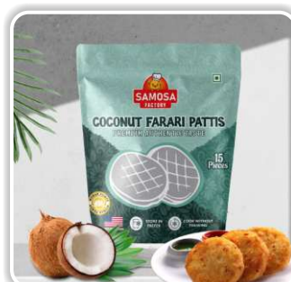
Coconut Farari Pattis