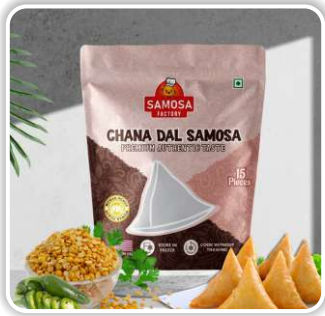
Chana Dal Samosa