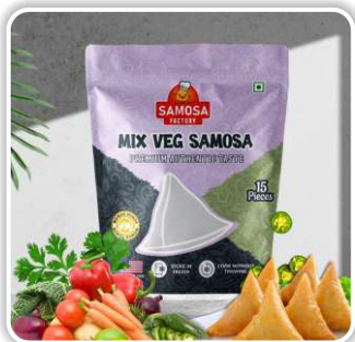
Mix Veg Samosa