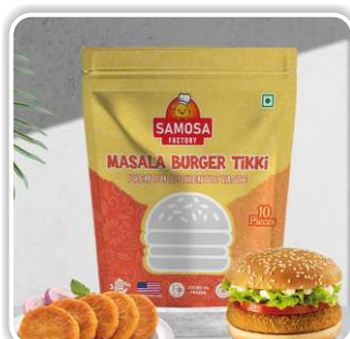
Masala Burger Tikki