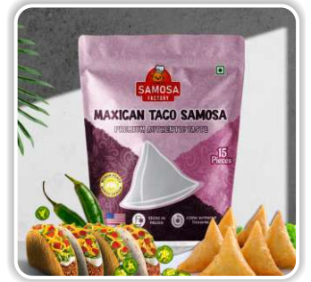
Mexican Taco Samosa