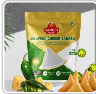
Jalapeno Cheese Samosa