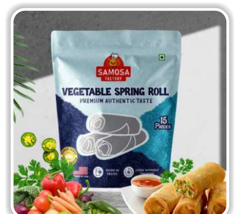
Vegetable Spring Roll